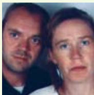
Call Back Theatre